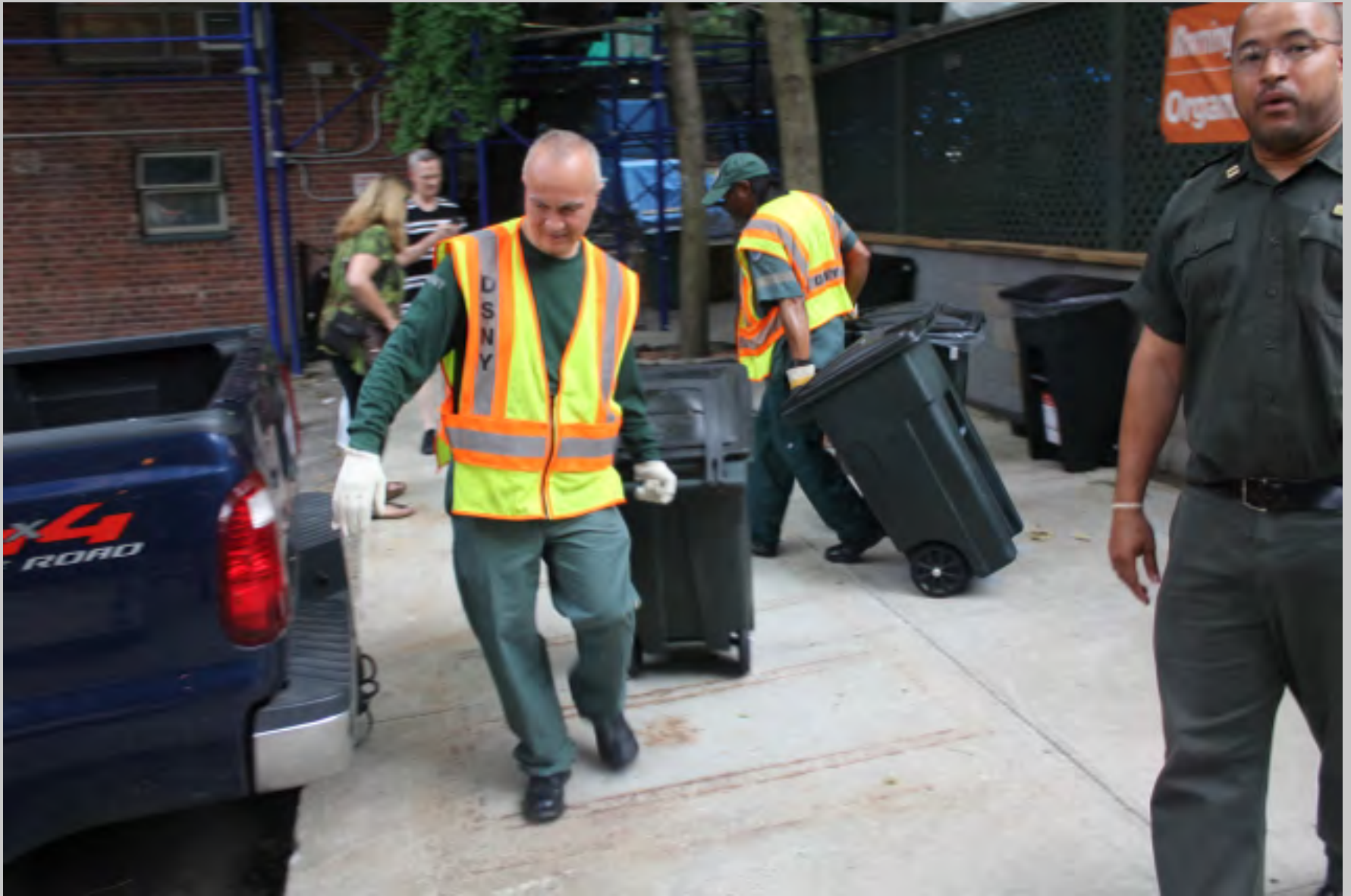
First day of organics collection by DSNY