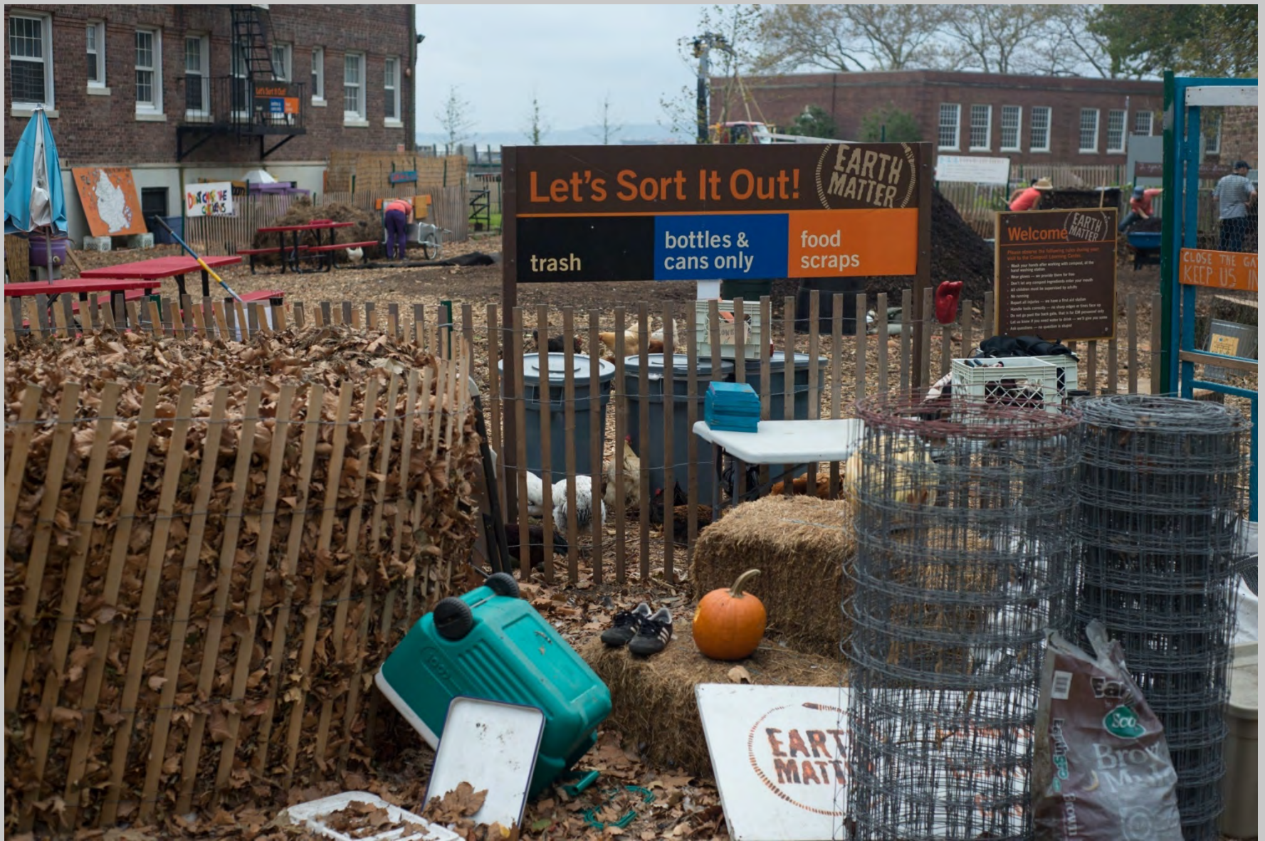
Earth Matter, Governors Island