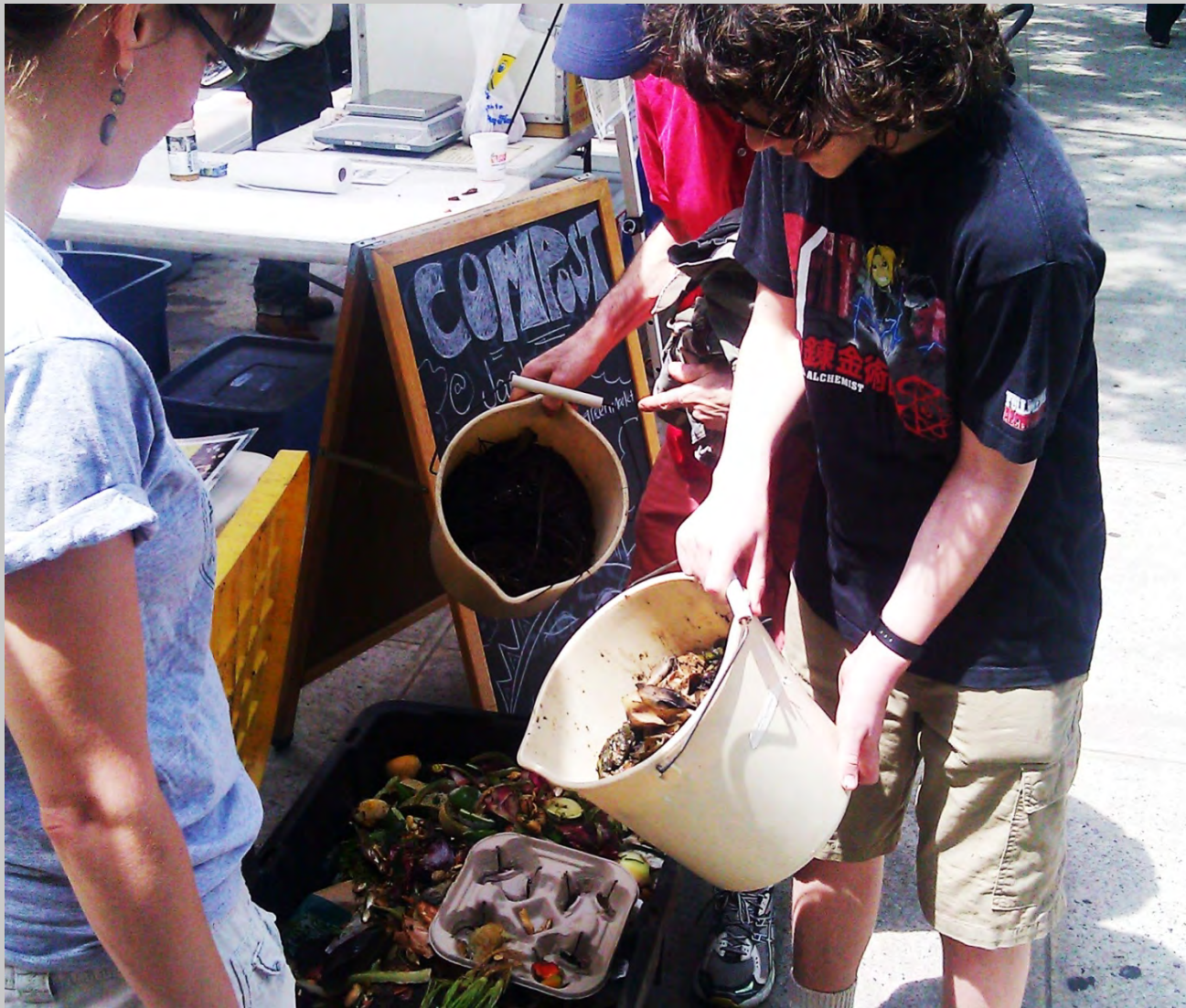
Western Queens Compost Initiative (now BIG!Compost) began collecting food scraps for composting at 3 Queens Greenmarkets in 2010