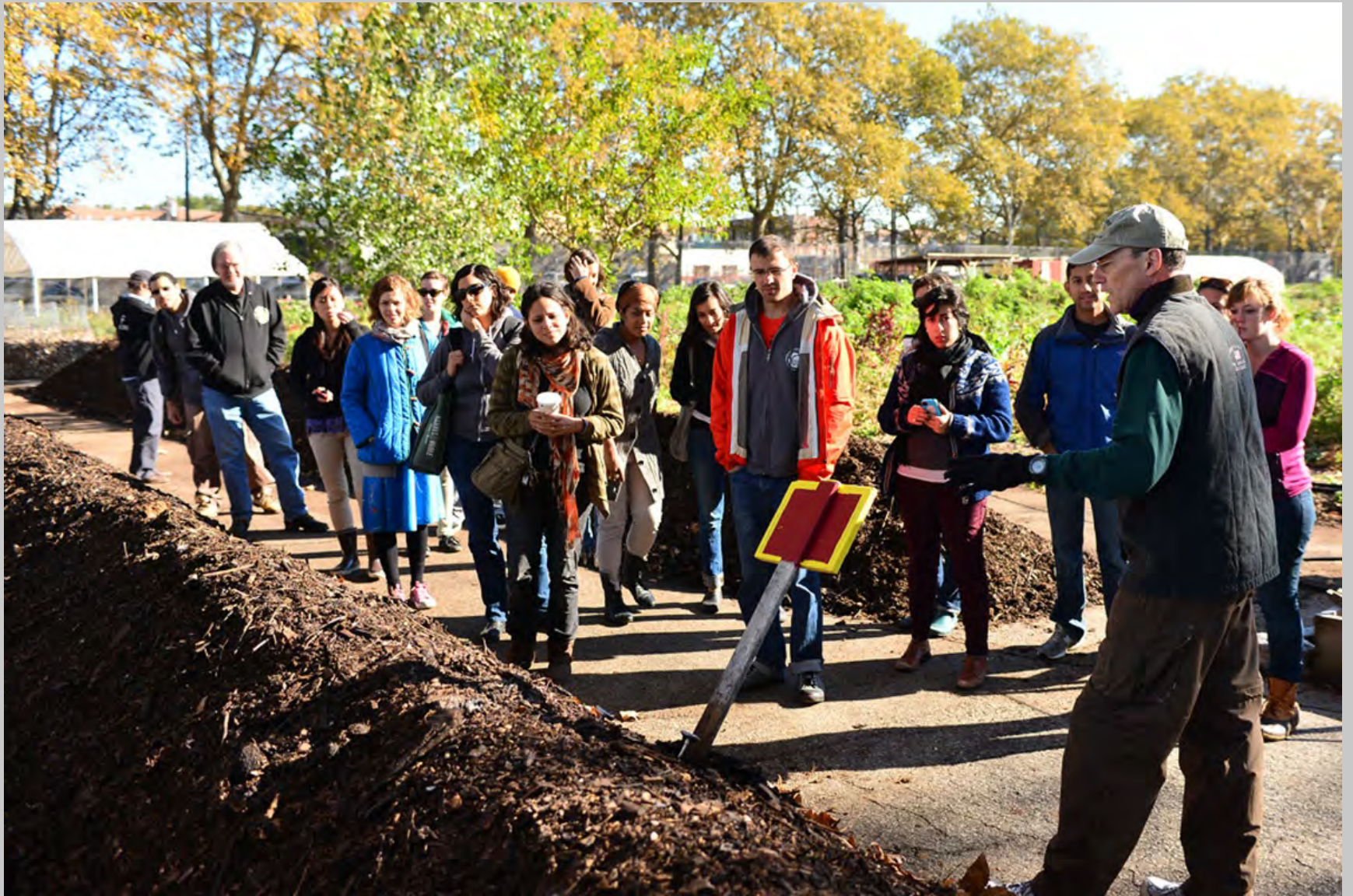
Added Value/Red Hook Community Farm