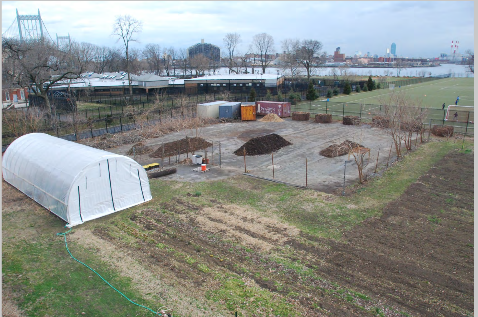
Active Citizen Project/Project EATS, Wards Island