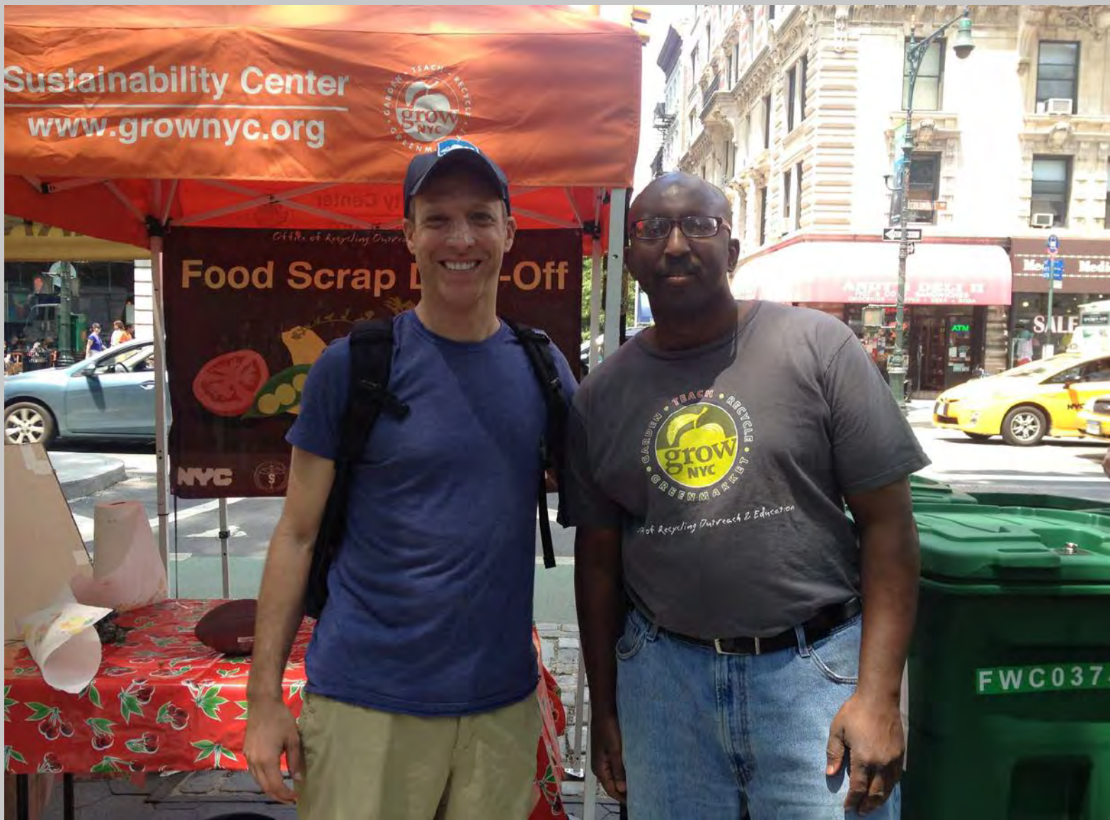
"GrowNYC continues to build a foundation for a citywide curbside organics program by demonstrating the popularity of the Greenmarket drop off programs," said Ron Gonen, Deputy Commissioner of Recycling and Sustainability at NYC Department of Sanitation.